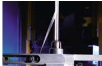
No deflection of wire during taping