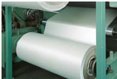
Laminating machine for manufacturing of Cablosam® tapes