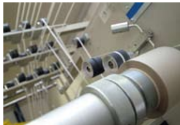
High-tech slitting machine for cross-wound spools