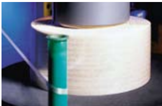
Perfect de-rolling of the spools

Conductors, stranded wires or cables insulated in this manner can then be covered with thermoplastic material to form the final product.