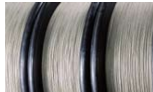
Cablosam taped conductors