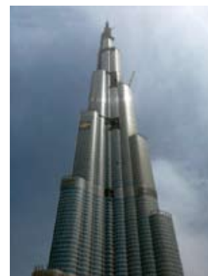
Highest skyscraper in the world, Burj Dubai